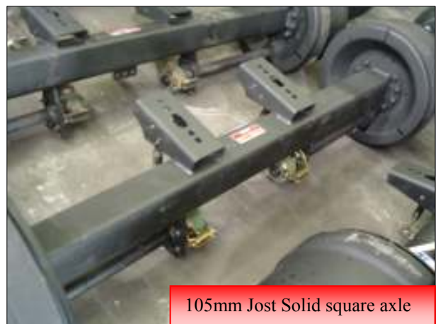
105mm Jost Solid square axle