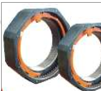
Jost self-torque axle nut

You may consider specifying the Jost self-torque nut with your Jost axle for added peace of mind. The nut torques itself to the correct setting ensuring better tyre wear, increased bearing and seal life, and less time in the workshop.