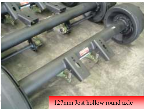
127mm Jost hollow round axle