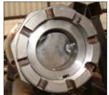
Jost standard axle nut

You may consider specifying the Jost self-torque nut with your Jost axle for added peace of mind. The nut torques itself to the correct setting ensuring better tyre wear, increased bearing and seal life, and less time in the workshop.