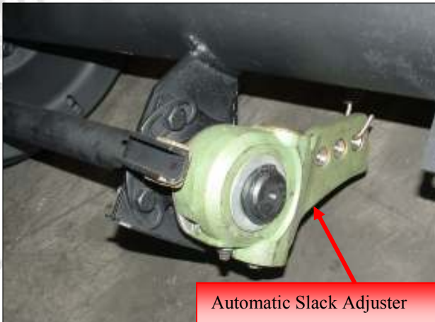
Automatic Slack Adjuster

If your trailer was manufactured after 14 February 2004, by law your trailer axles must have Automatic Slack Adjusters fitted as shown on these JOST axles.