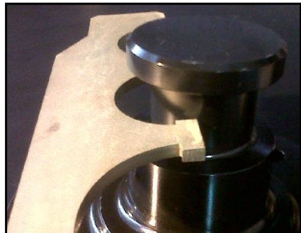
J909L Gauge measuring kingpin thread size