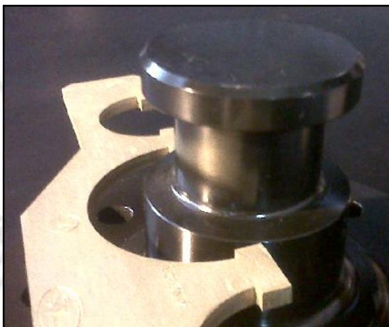
J909L Gauge measuring kingpin top flange

The more relevant question is what is the cost of not replacing the gauge when it is worn or bent? The J909L gauge is a go / no go gauge which means that it is manufactured to the minimum dimensional requirements, in other words once the minimum dimension has been reached the gauge will go over the wearing area signalling the time has come to replace the kingpin, however if the gauge is worn or bent past the 0.1mm maximum allowance then you will be scrapping kingpins that are still serviceable.