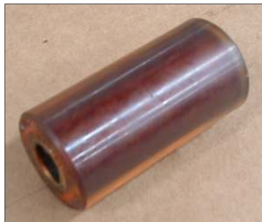
Jost polyurethane spring saver.