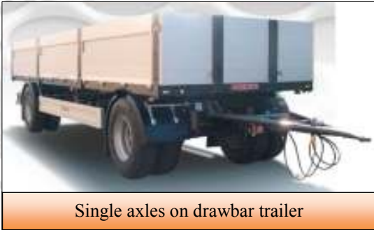
Single axles on drawbar trailer

3. How many axles required for your trailer: 1-2 or 3axles?