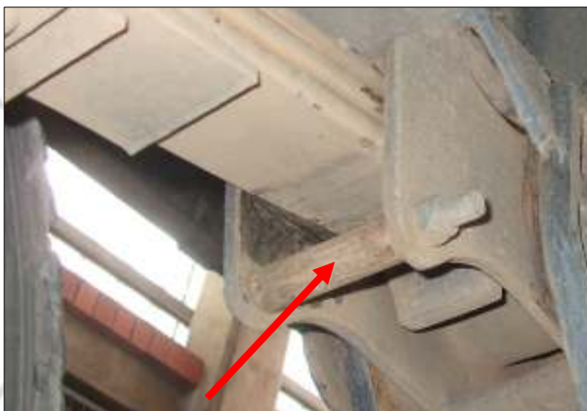
Unprotected retainer bolt tube

In order to reduce shock loads and prolong the life of the spring pack, Jost suspensions also offer as standard equipment a polyurethane spring saver instead of the traditional retainer bolt tube. Spring savers are available in 3 versions, for 7-8 or 9 blade springs.